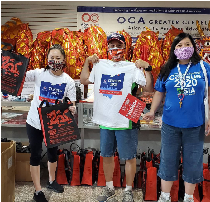
Joining forces with OCA Greater Cleveland in July 2020 to promote 2020 Census participation.