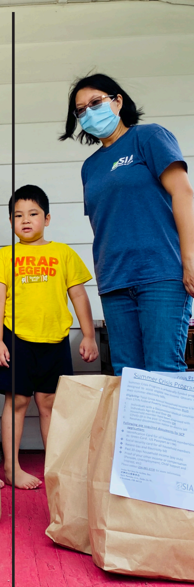
le home goods were distributed to