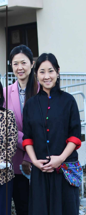
g Boundaries in Health