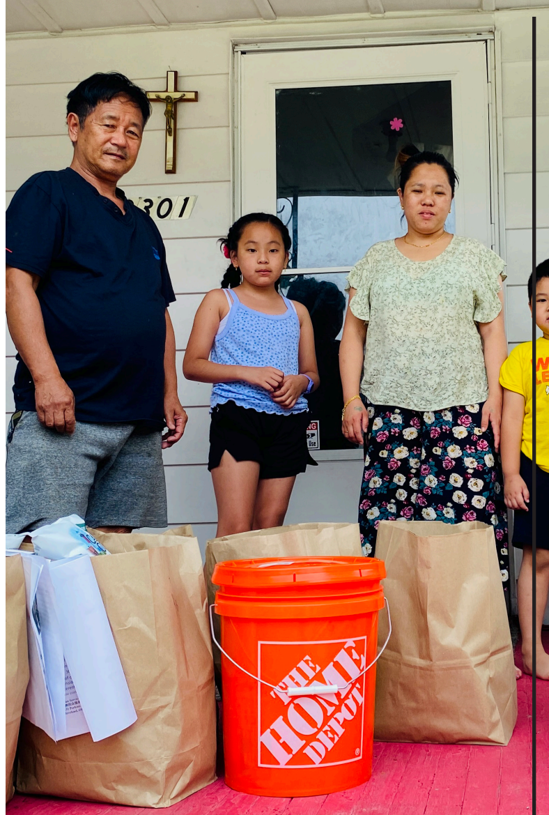
Making home deliveries. Over 10 tons of fresh produce and non-perishable h 200 families throughout Akron and Cleveland in July of 2021.

Despite the various challenges COVID presented to service providers across Northeast Ohio, the Ahimsa department thrived. Because of the increase in victimization related to the pandemic, we experienced a drastic increase in client referrals. Our team worked corroboratively to develop a strategic plan outlining how to accept new cases and deliver the most trauma-informed services in COVID-safe environments. This past year tested our ability to handle some of the most difficult cases with far less resources than we were accustomed to. However, Ahimsa persevered for the betterment of the department, but most importantly, for the sake of our clients.