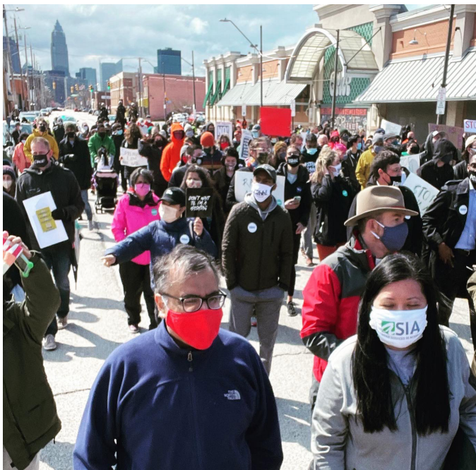
Hundreds of Northeast Ohioans of all backgrounds participating in the #StopAAPIHate rally held on March 28, 2021.

With the chaos and confusion created by the pandemic, ASIA's Community & Civic Engagement team was even more diligent ensuring the voices of our constituents were heard by local and national legislators. Heroic measures were taken so that members of the Asian American/Pacific Islander community were counted in the 2020 Census while equal efforts focused on voter education and registration for the 2020 Election. Our connection with the community never faltered during this time, and in fact, increased as we continuously provided critical information by trusted voices and in preferred languages.